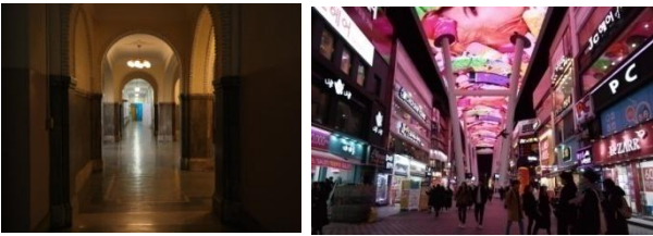
Daejeon City tour