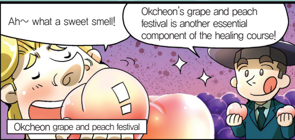
Okcheon grape and peach festival

Okcheon's grape and peach festival is another essential component of the healing course!