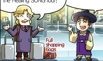
Full shopping bags

I will come back every year~ Thanks Healing SONG!