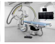
최신 콘빔 CT장치 Bi-plane

Sun Hospital was founded for the purpose of "Provide the best care possible for each and every patients without limit." Advanced medical equipment enhanced the quality of medical treatment such as 3.0T MRI, 256Ch CT, PET-CT, Bi-Plane, SPECT, RapidArc, ABVS.