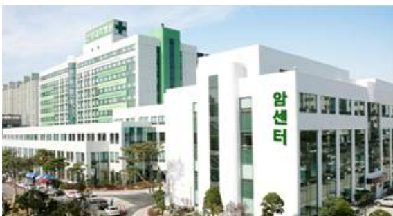
Konyang University Hospital

Konyang University Hospital is ready to be highest level of medical care center based on the tradition and know-how of the Kim's eye clinic with a 40 years history. Konyang provides patients specialized care by professional medical staffs in all area of ophthalmology including cataract, glaucoma, retina, vitreous body, squint etc.