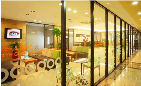
Boda lasik&lasek center

Boda lasik&lasek center has two meanings : “See”, as the most basic function of vision and “More” as the better facilities, capabilities than any other lasik&lasek center. It opened in 2011 and has 4 ophthalmologists. In addition, BODA offers personalized medical service including operation and post operative care.